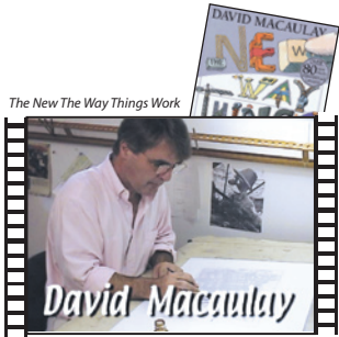
Art David Macaulay