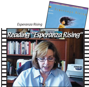
Social Studies Pam Muñoz Ryan