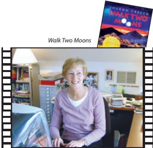
Middle School Sharon Creech