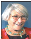
Vera B. Williams